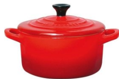
15 Foodie Pick-Up Lines