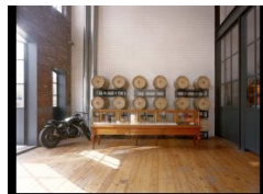
From Rocket Science to the Language of Love: Chocolate at Cacao Prieto

More: America's Top 10 New Sandwiches, 2011 Top 10 Foods Only America Could Have Invented