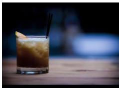
Anti-Valentine's Day Cocktails